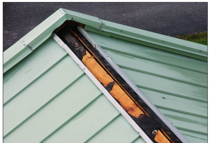
Figure 9. The ridge flashing fasteners were placed too far apart. A significant amount of water leakage can occur when ridge flashings are blown away.