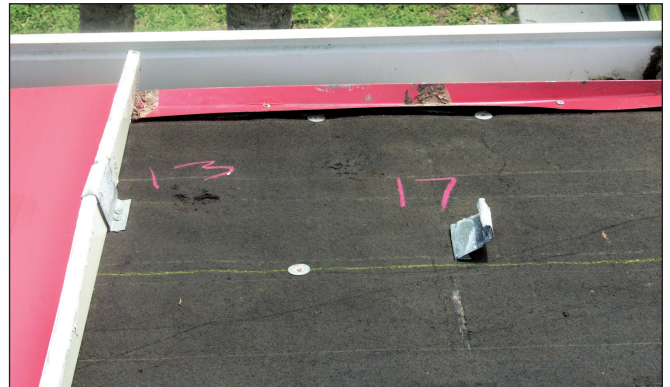
Figure 4. These eave clips were too far from the panel ends. The clip at the left was 13" from the edge of the deck. The other clip was 17" from the edge. It would have been prudent to install double clips along the eave.