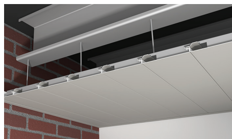
Flush Lineair Opaline (OPF) Ceiling with Snap In Carrier